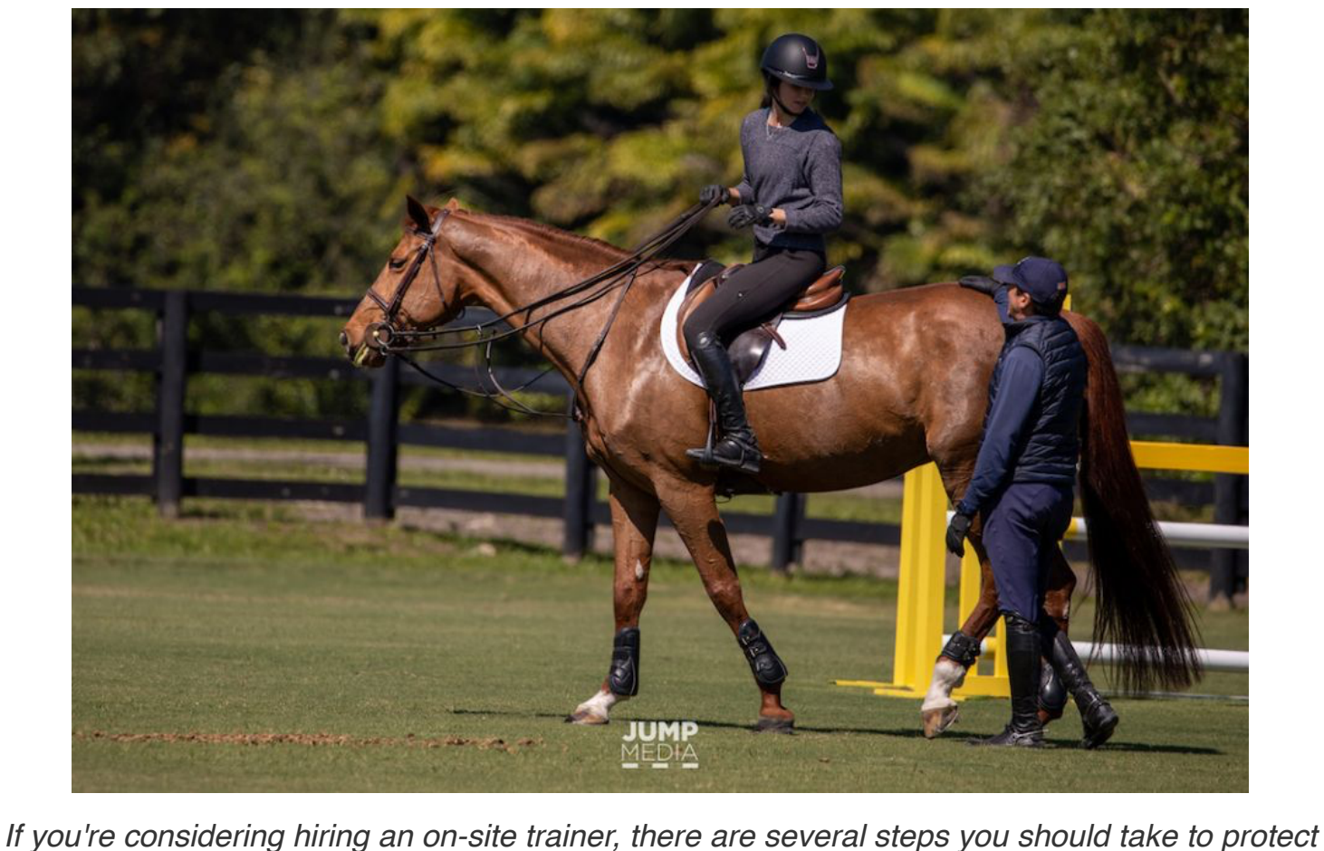
yourself legally and to ensure a mutually beneficial experience.

Because you are operating a boarding barn, more than likely you've required all of your boarders, or anyone else who rides on your property, to sign your farm's liability release. If you're considering letting outside riders ship in for lessons with this trainer, they must also sign your farm's release form.